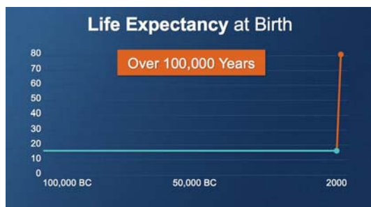
Human civilization enters uncharted ageing territory thanks to the longevity revolution.

My time working for XPRIZE was an incredibly rewarding experience. XPRIZE ( www.xprize.org ) is a non-profit and global leader in solving the world's Grand Challenges by creating and managing large-scale incentive prize competitions. Some of XPRIZE's past and current prizes include the $10M Ansari XPRIZE for suborbital spaceflight, which launched today's $3B private sector space industry; the $30M Google Lunar XPRIZE to land a privately funded rover on the Moon; and the $10M Qualcomm Tricorder XPRIZE to bring healthcare to the palm of your hand. Prize competitions democratize innovation and break research silos, inspire additional investment, pay only for success and raise public awareness about important issues. The team that wins the XPRIZE competition wins the multi-million dollar prize purse. The 10 criteria against which an XPRIZE proposal are measured are: Massive Transformative Purpose, XPRIZE needed, Prizeable, Solid Prize Structure, Critical Mass of Teams, Exponential/Forward Looking, Ecosystem and Advocacy, Results in Impact Independent of a Winner, Scales Impact, and Fundable.